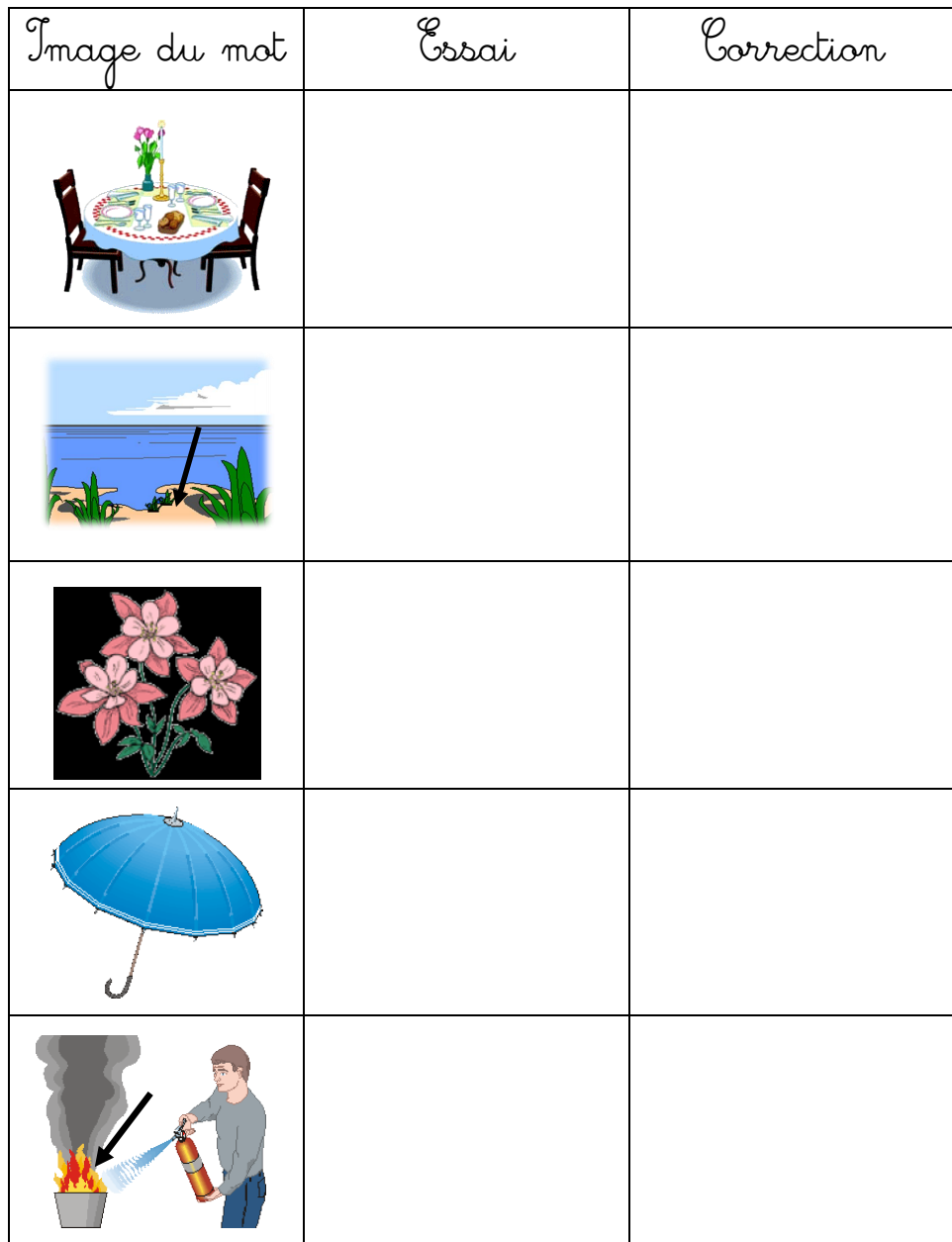
Tableau d'encodage : le son [ bl, cl, fl ]